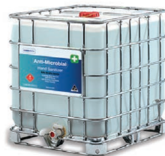
Bulk 1000 Litre IBC