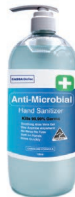
1 Litre Bottle