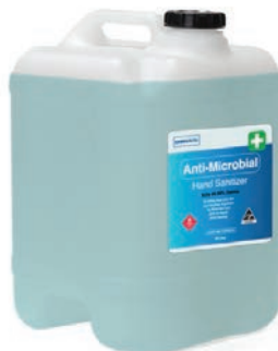
Bulk 20 Litre Drum