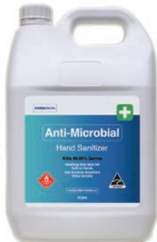
2.5 L & 5 L Refill