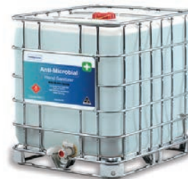
Bulk 1000 Litre IBC