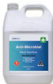
2.5 & 5 Litre Refill