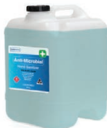
Bulk 20 Litre Container