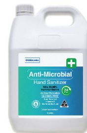
5 Litre Refill