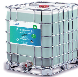
Bulk 1000 Litre IBC