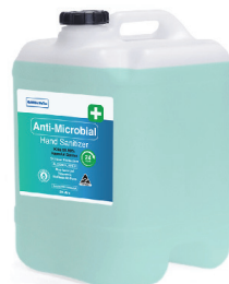
Bulk 20 Litre Container