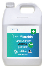
2.5 Litre Refill